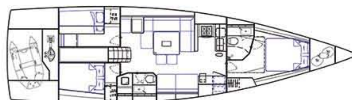
Forward galley version

LOA: 15.800 m LWL: 14.840 m Bmax: 4.650 m DSPL: 12.5 t Draft: 2.45 / 2.85 m Main Sail Area: 90 m 2 Jib Sail Area 108%: 67 m 2 Gennaker area approx: 300 m 2 Engine: 75 Cv Water Tank: 500 Lt Fuel Tank: 360 Lt Construction: Epoxy infusion - Sandwich Glass/Carbon Mast Construction: Carbon